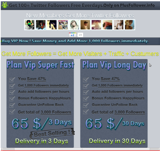
Figure 1: A Twitter Account Market