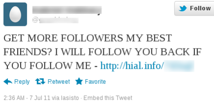
Figure 2: A tweet advertising a Twitter Account Market